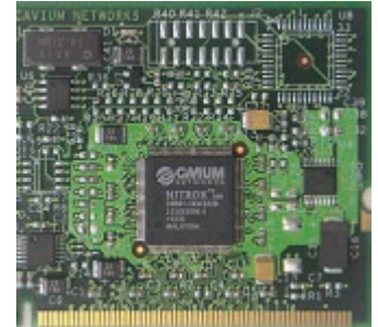
NITROX Mini-PCI Board

The NITROX Mini PCI Board enables system designers to quickly integrate high performance IPsec, SSL or Wireless security protocol processing into their systems. The NITROX Mini-PCI Board can be used with a wide variety of networking equipment like home gateways, wireless appliances, SME routers, switches, web-servers, server load balancers, firewalls, storage and VPN gateways.